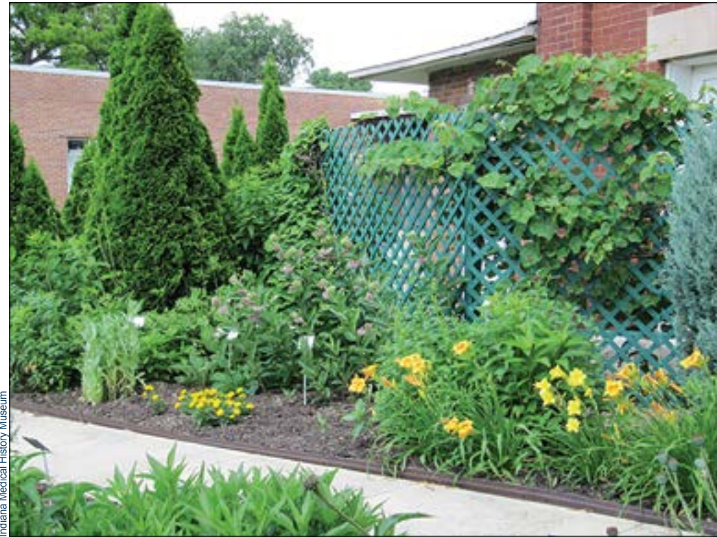
The Indiana Medical History Museum won a grant from INPS to help provide signage at its demonstration gardens in an under-served community in Indianapolis.

Four of nine grant applications received for the INPS 2018 grant cycle have been awarded funding, totaling $5,500.