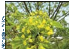
Blossoms of Callery pear (top) and Norway maple – two invasive tree species that advocates hope to eventually add to the list of banned plants